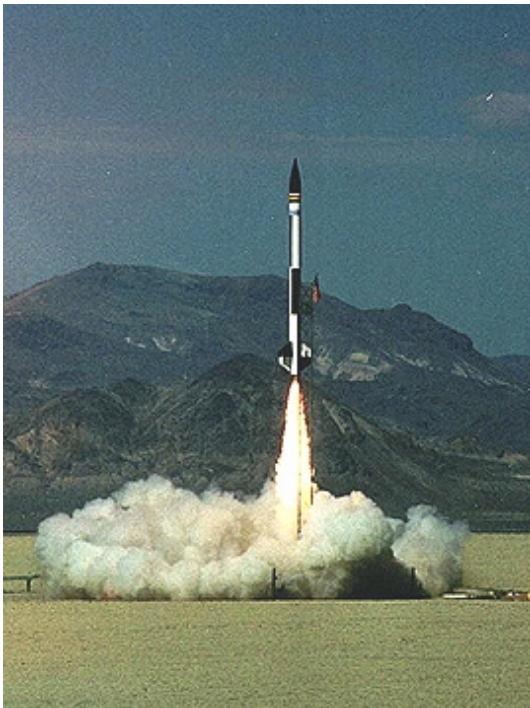
Kimberly Harms’ C-8 has a spectacular lift-off on an N2000 and 2 K700s. The K700s fired late at the time of main parachute deployment but C-8 was recovered safely.

But flying activities weren’t over yet! Aeropac had night flights planned for Saturday night and a number of fliers took advantage of the opportunity. The sky was clear and full of stars and probably 25 or 30 flights were made with cyalume sticks, high power strobes and neon lights attached to various and sundry rockets. The evening was nothing if not entertaining.