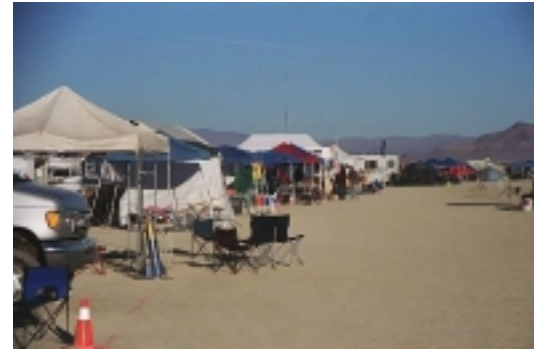
The flightline at the October 5th—7th Aeropac 13 launch at Black Rock, NV.

The route off of the road onto the lakebed was well-marked. And we could see the tell-tale orange traffic cones stretching off into the distance that would lead us to the Aeropac launch site some 15 miles or so away. The lake bed was covered in a much thicker layer of dust than we had seen in the past. Getting up to a cruising speed of 65 mph or so, the motorhome hit an even thicker layer of the dust and began to fishtail like one would hitting 4 or 5 inches of freshly fallen snow. In fact, after slowing down a bit to determine what was happening, I had trouble speeding up again because the RV's tires began to spin! What an experience! A more prudent acceleration got us up to speed, however, and we eventually saw the car line in the distance.