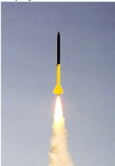
Tom Gonser's "N-tropy", a 5" G-12 rocket streaks skyward on a Paul Robinson N3000. The 16,000 ns motor put "N-tropy" up to 23,000' in the clear Nevada skies.

The igniters "spit" a bit, the motors came up to pressure fairly slowly for Blue Thunder propellant and Pothos II lifted off of the pad. The rocket took a quirky "bend" at the top of the Gates Brothers launch tower and angled off over the crowd. The airstarts for the second set of motors could have lit sooner as the rocket now angled even more toward Gerlach. Pothos II picked up speed and disappeared into the clouds. The rocket deployed its 20' Rocketman drogue at a high rate of speed partially shredding it. The rocket fell fast to main deployment altitude where the main fired. The high speed under the shredded drogue deployment and the heavy weight of the rocket caused the shock